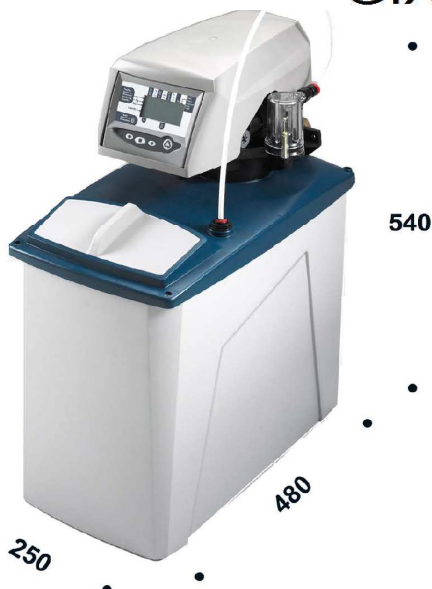
WATER NETWORK CONNECTIONS