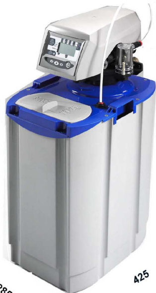
WATER NETWORK CONNECTIONS